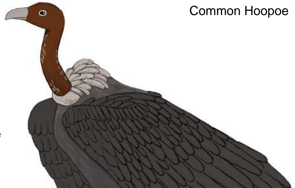
Indian Grey Vulture