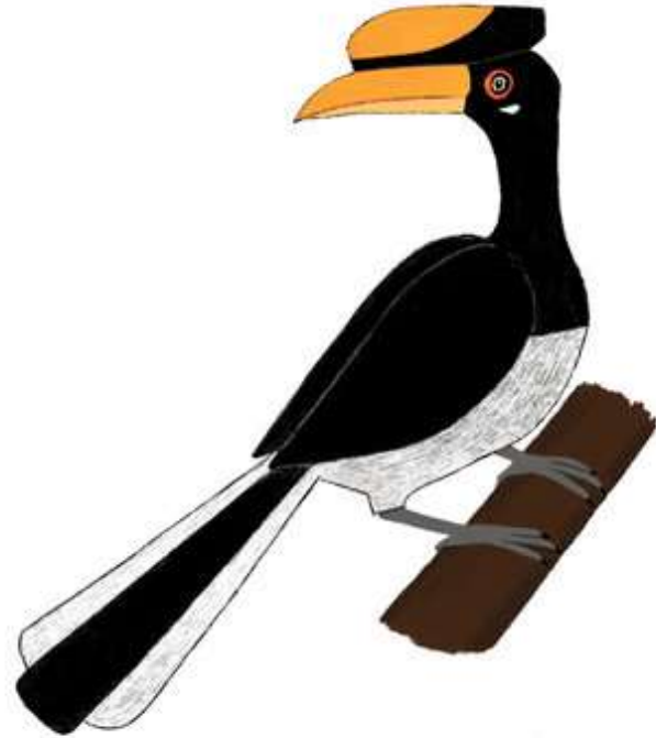
Great Indian Hornbill