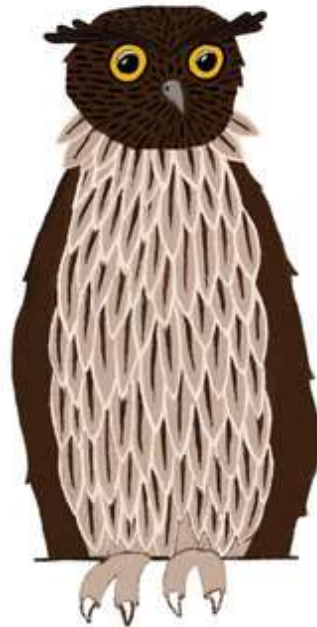
Brown Fish Owl